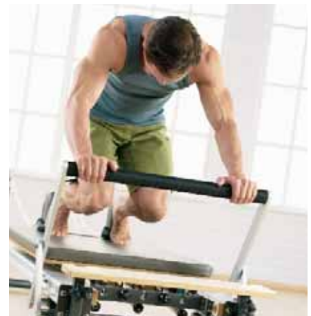
MK-02915 0713-5-5B INSTRUCTOR TM © Trademark or registered trademark of Merrithew Corporation, used under license. Printed in Canada. All rights reserved.

STOTT PILATES is the producer of the world's largest Pilates DVD collection with more than 120 award-winning titles dedicated to At Home exercisers and professional programs for instructors covering the fundamentals to unique sport-specific, prenatal, rehab and active aging repertoire. Find our complete line of DVDs at www.stottpilates.com .